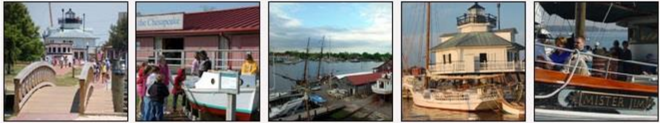
Photo from the Chesapeake Bay Maritime Museum web site