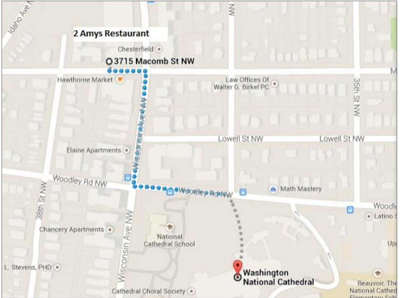
Figure 3 Walk from National Cathedral to 2 Amys Restaurant