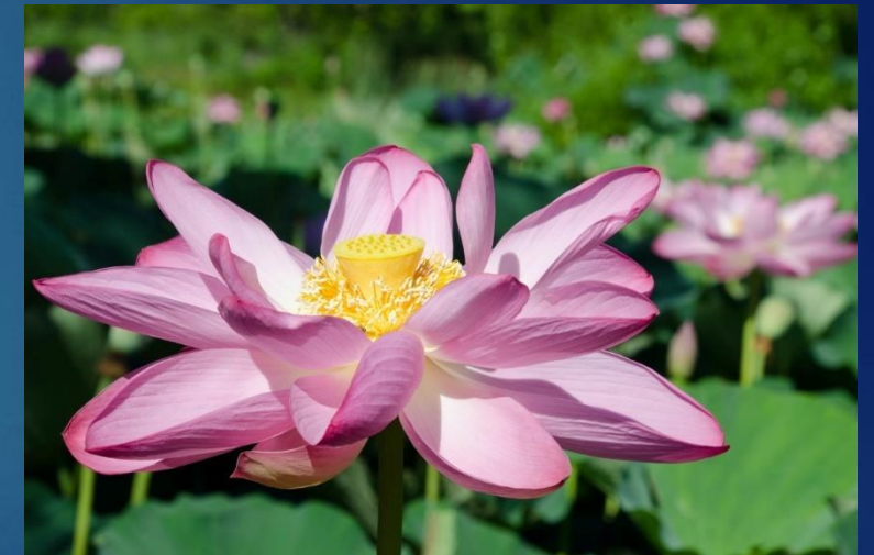
Lotus at Kenilworth Gardens