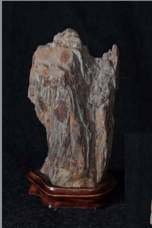
1/60sec at f/22 ISO 400