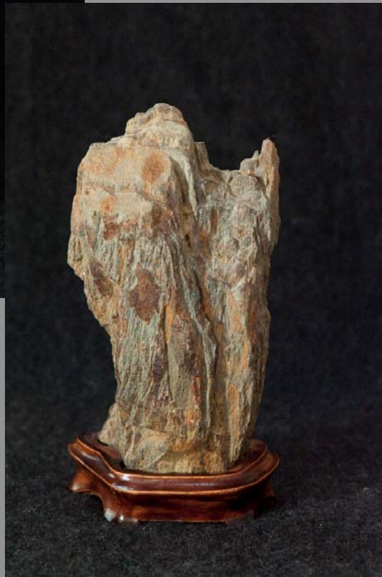
1/60sec at f/16 ISO 6400 Right light at -0.7EV