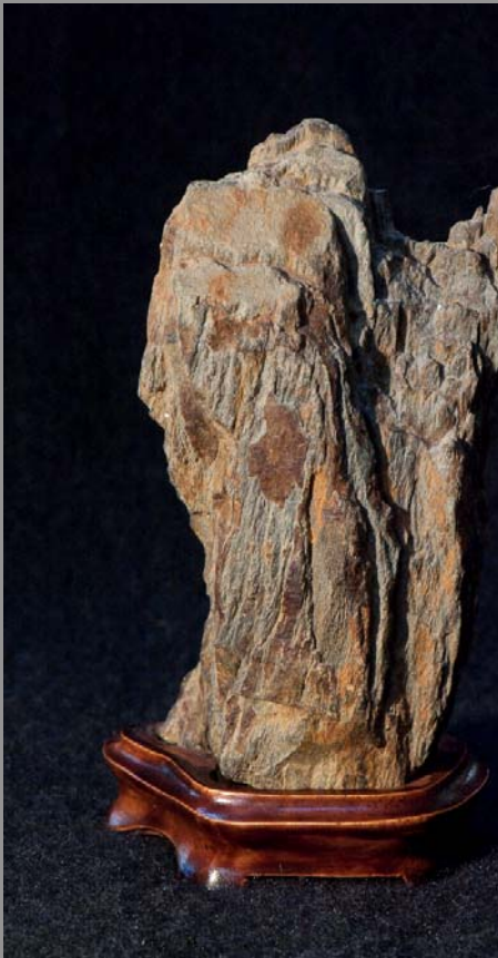
1/45 sec at f/22 ISO 6400