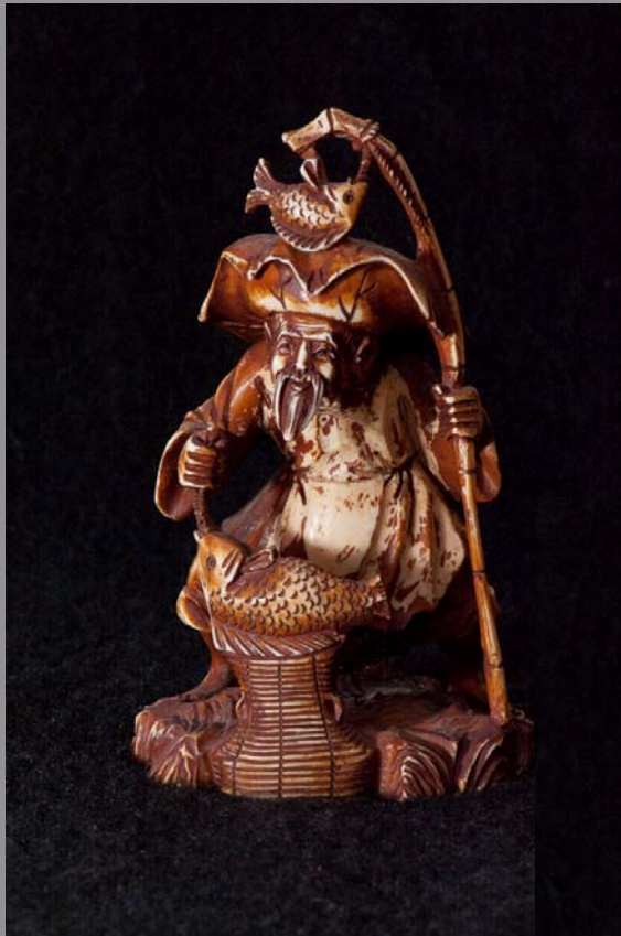
1/60 sec at f/22 ISO 6400