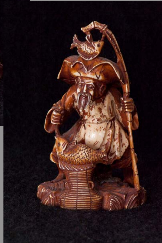
1/60 sec at f/22 ISO 6400 With Reflector