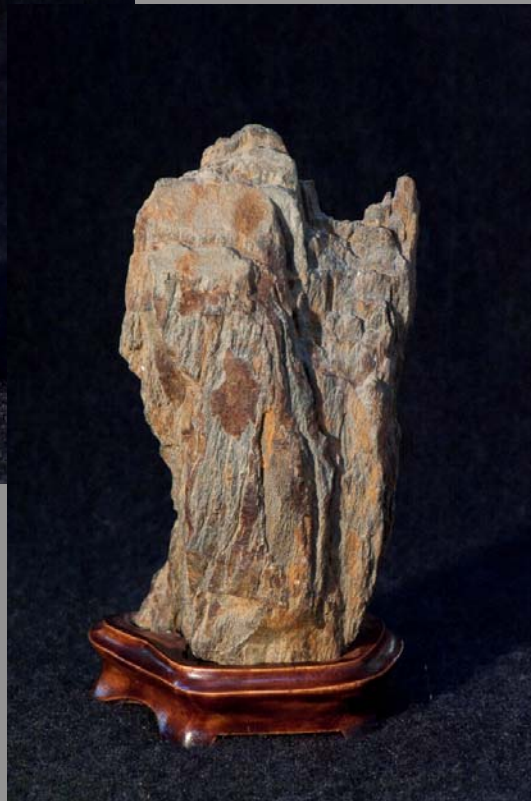
1/60 sec at f/22 ISO 6400 With reflector