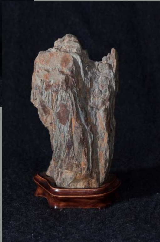
1/60sec at f/22 ISO 400