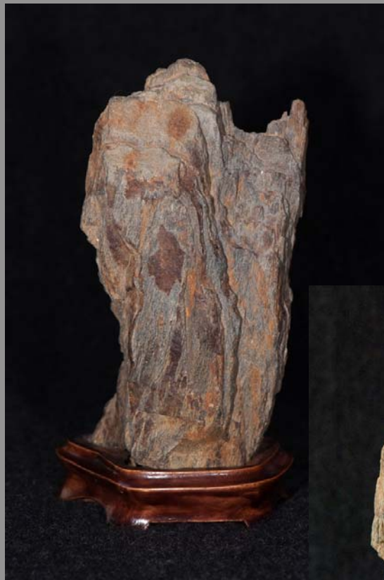
1/60sec at f/16 ISO 800 Both lights same power